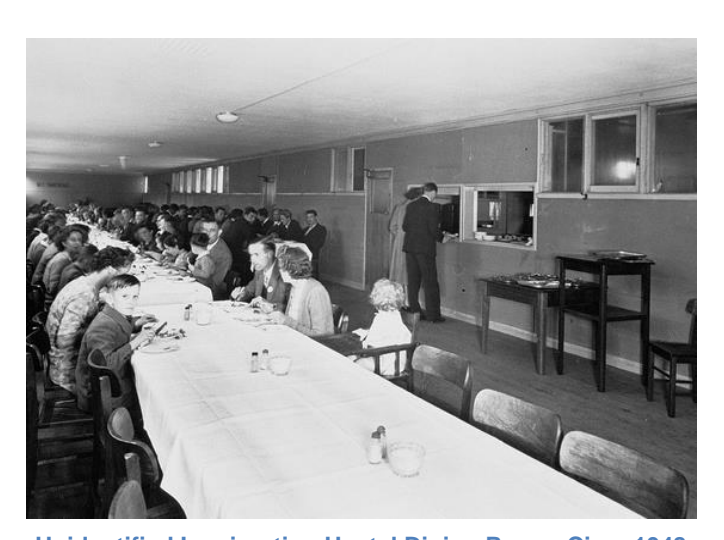
Unidentified Immigration Hostel Dining Room, Circa 1948