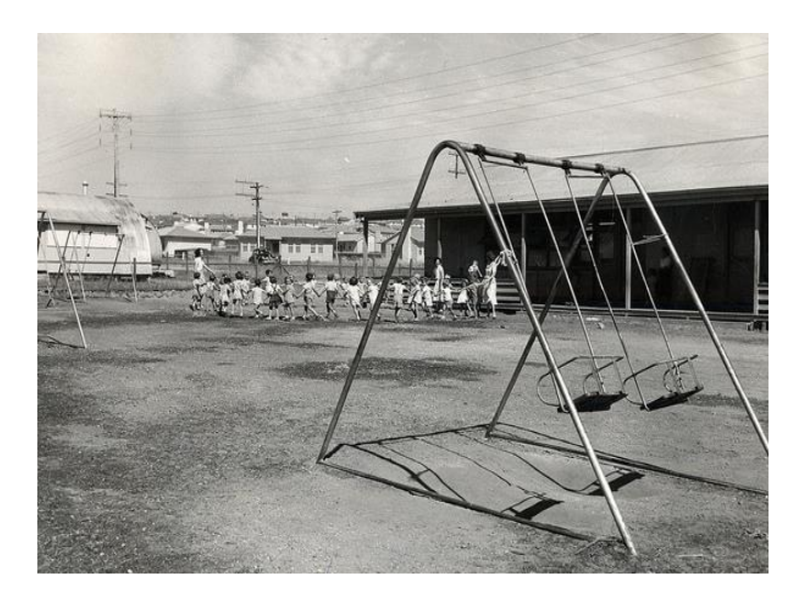
Playground at Gepps Cross Hostel, Circa 1950