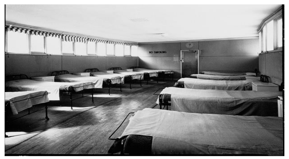
Immigration Hostel dormitory circa 1948

Produced for State Records of South Australia in fulfilment of the requirements of the Arts Internship Program 2012, University of Adelaide, South Australia.