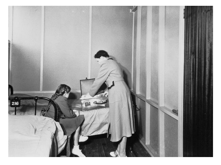
Unidentified Immigration Hostel bedroom, Circa 1948

Sketchbooks from the Department of Engineering and Water Supply and Public Building Books of migrant hostels also are useful for establishing, clearly, the dimensions (and sometimes facilities) of the hostels. A copy of the Woodville Reception Centre Public