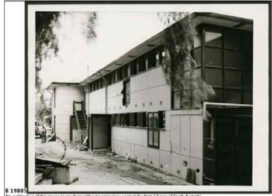
State Library of South Australia (Mortlock Library): B19805 - Migrant Hostel, Railway Rd, Adelaide, 1970. [Elder Park] (with permission)