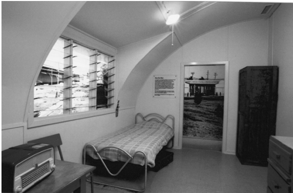
Migration Museum: “Reconstruction of interior of Nissen Hut” (original photograph provided) –with permission.