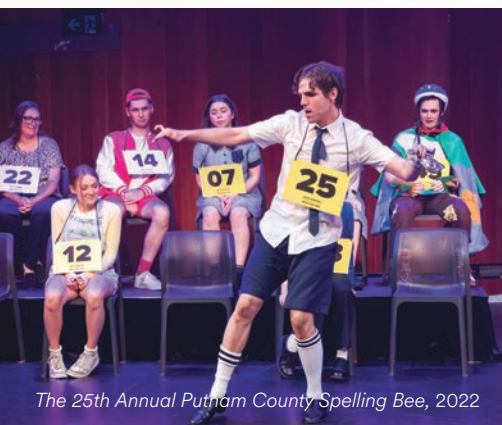
The 25th Annual Putnam County Spelling Bee, 2022