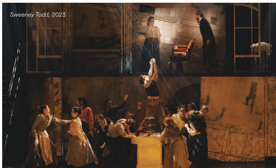
Sweeney Todd, 2023