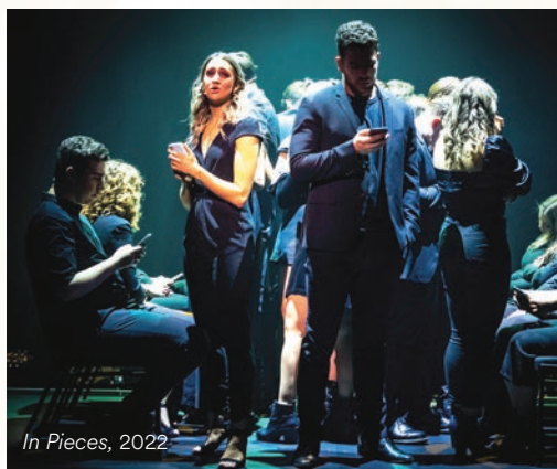
In Pieces, 2022