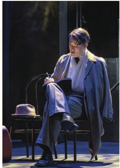
Cabaret , 2021