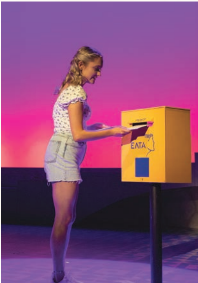
Mamma Mia , 2021