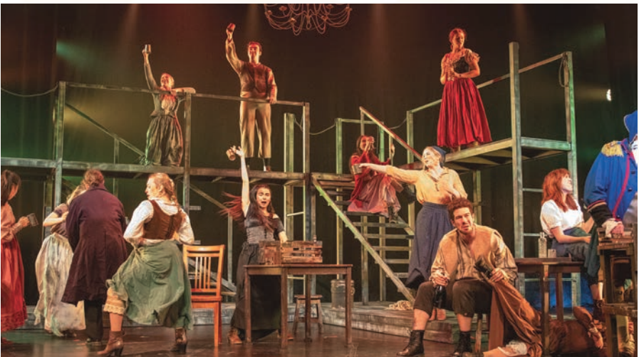
Les Misérables , 2022