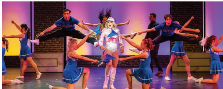
Legally Blonde, 2022